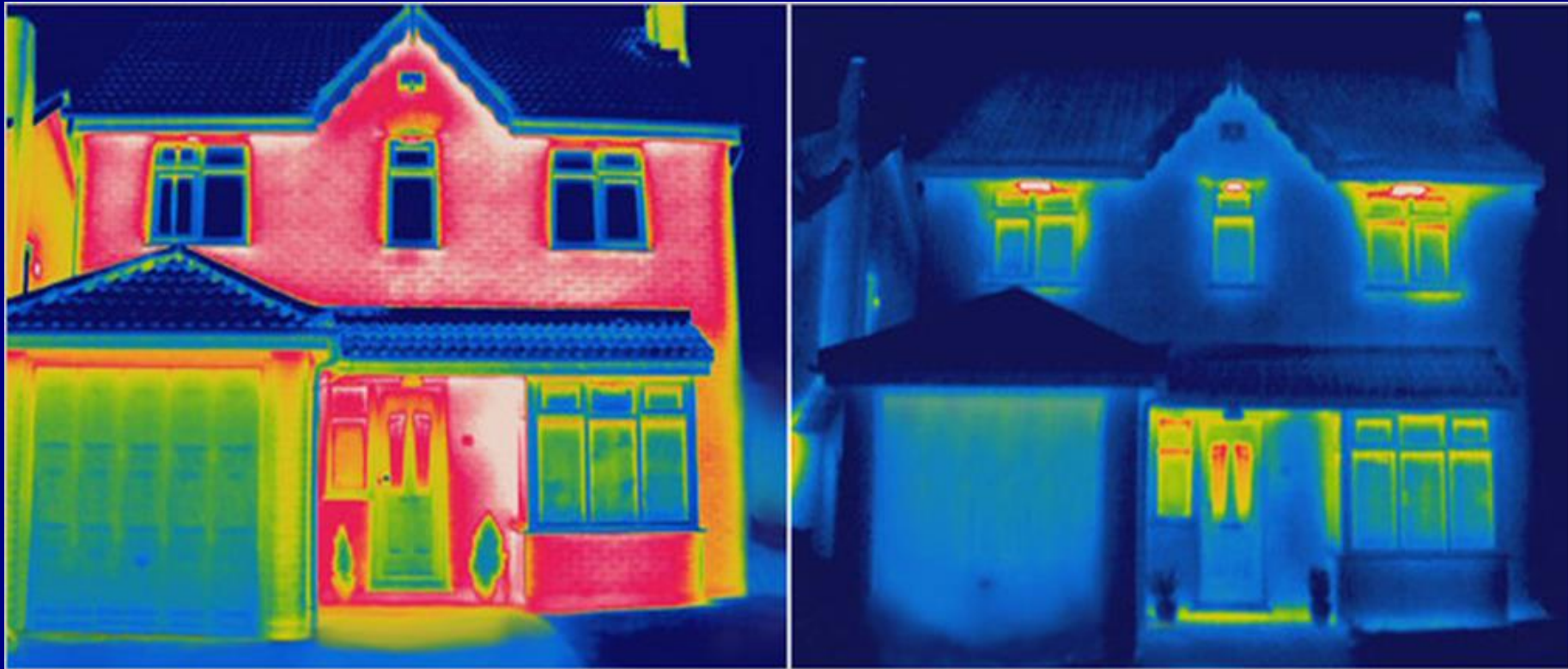
Much Heat Escapes